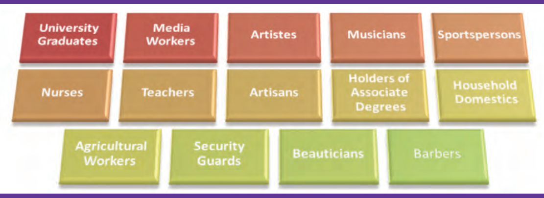
FIGURE 3: Category of persons who qualify for a Skills Certificate

For further information on the CSME, please visit the Ministry's website at www.mlss.gov.jm, LMIS web-site at www.lmis.gov.jm. and the CARICOM website at www.caricom.org.