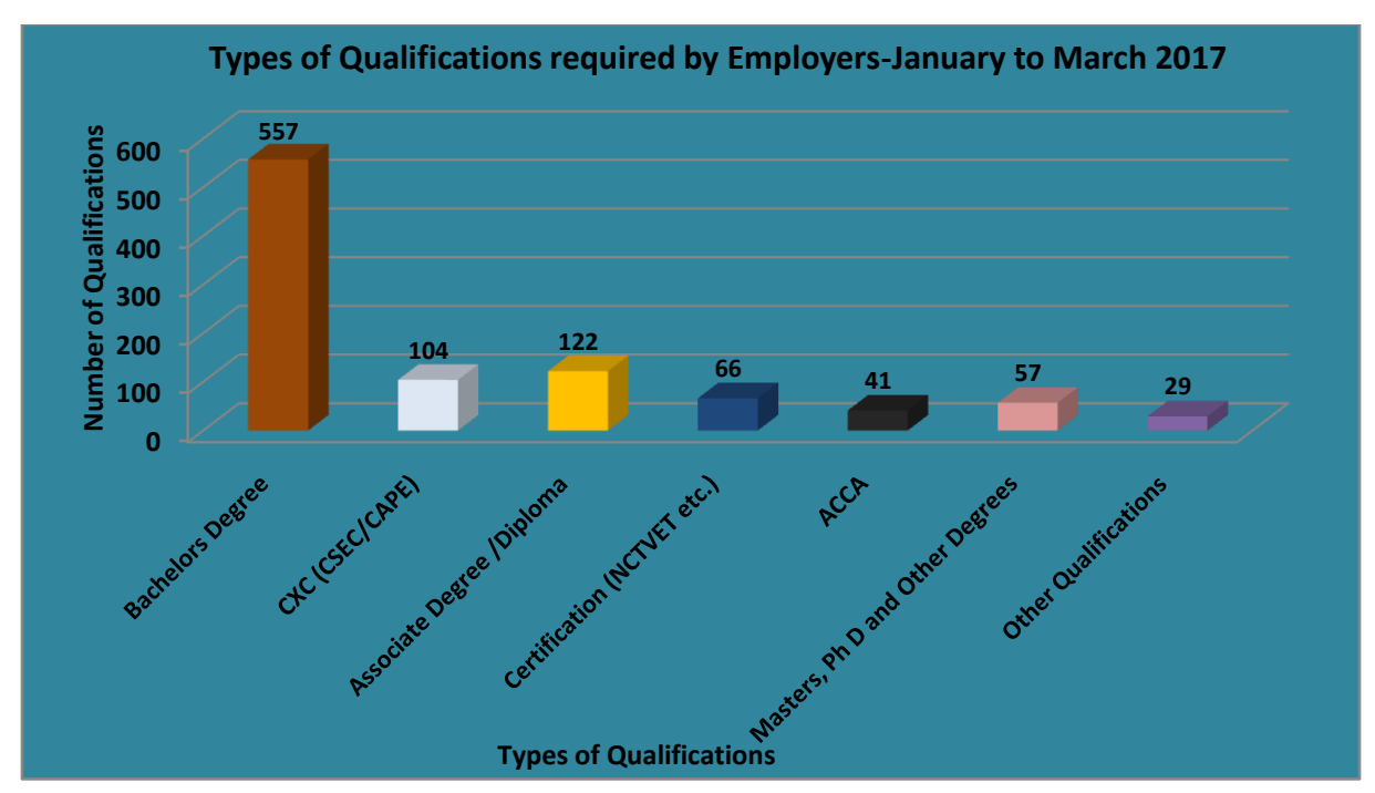
Figure 1

Of the number of jobs advertised, 1,019 or 57 per cent specified the required years of work experience. The most frequently requested years of experience were 2-3 years, followed by 4-5 years. Ten (10) years of service also figured prominently among the desired years of experience.